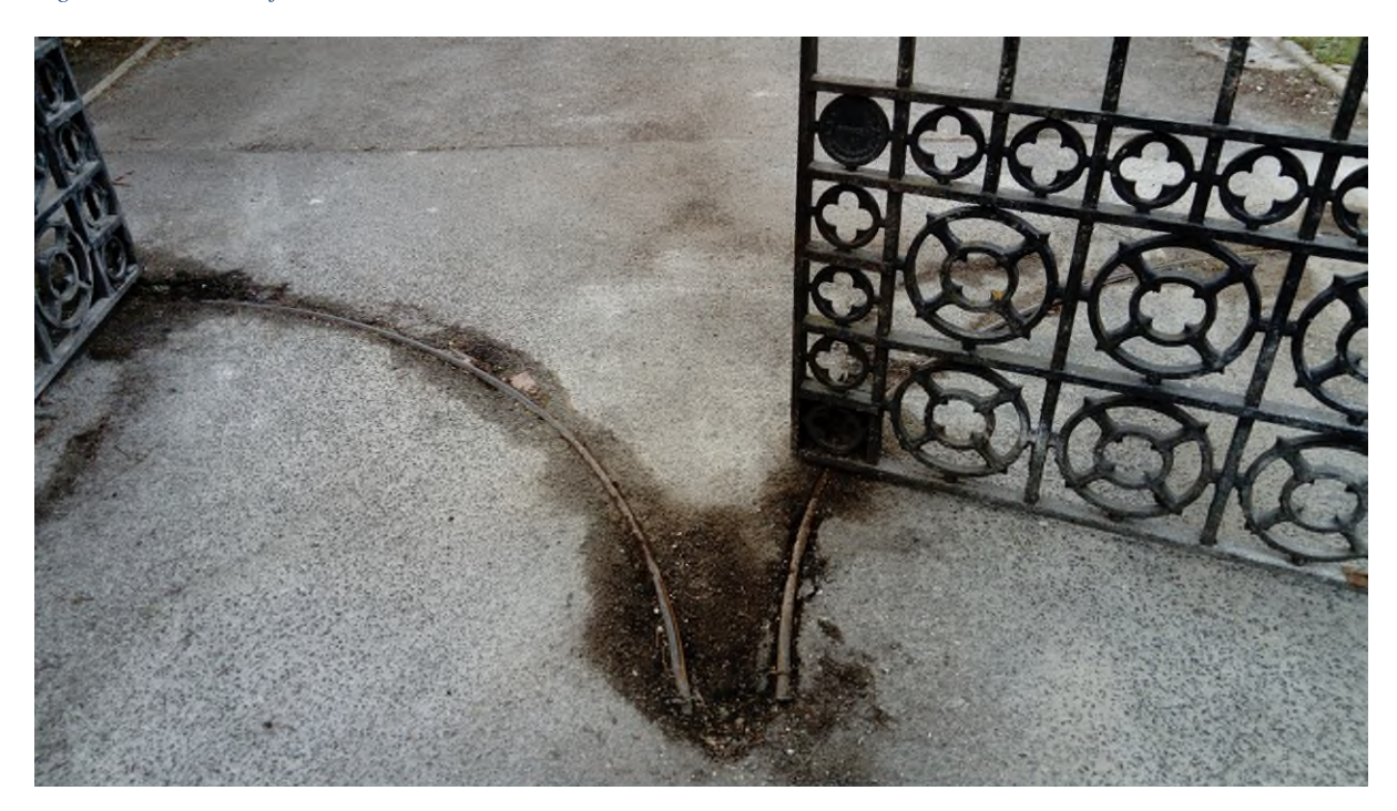
Figure 2 - Gates and wheel tracks