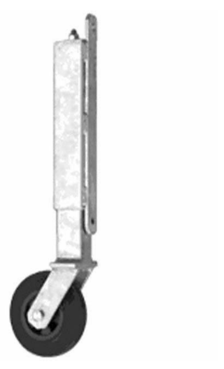
Figure\ 4\ -\ Gate\ supporting\ wheel\ (proposed)