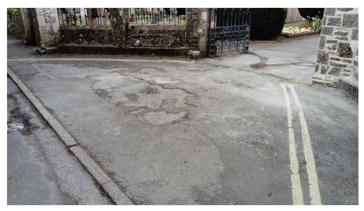
Figure 1 - Tarmac surface at entrance