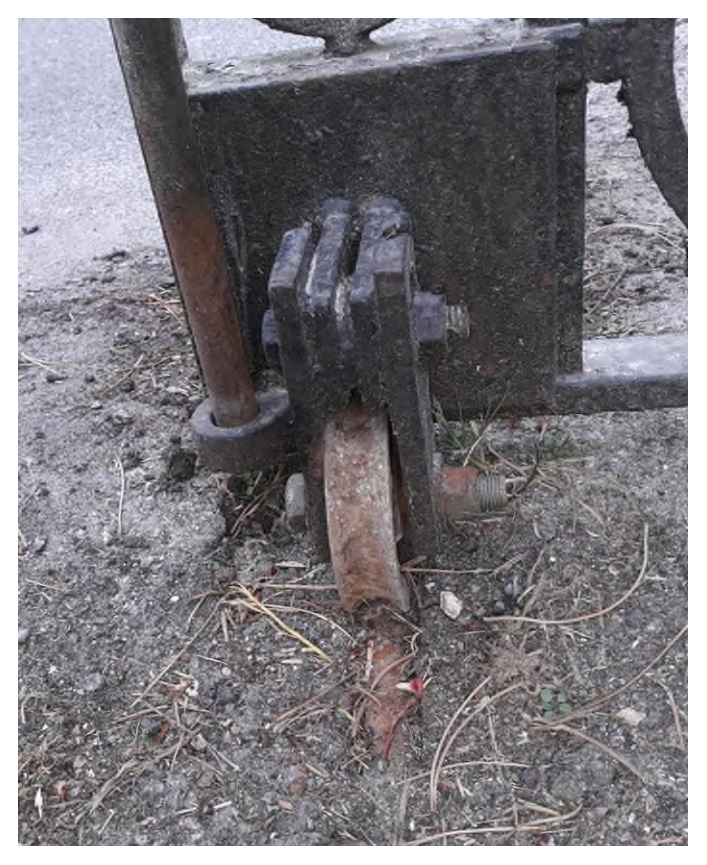
Figure 3- Gate supporting wheel (existing)