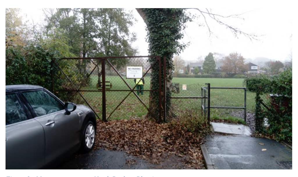
Figure \ 1 - Mature \ sycamore \ at \ North \ Poulner \ Play \ Area \ entrance