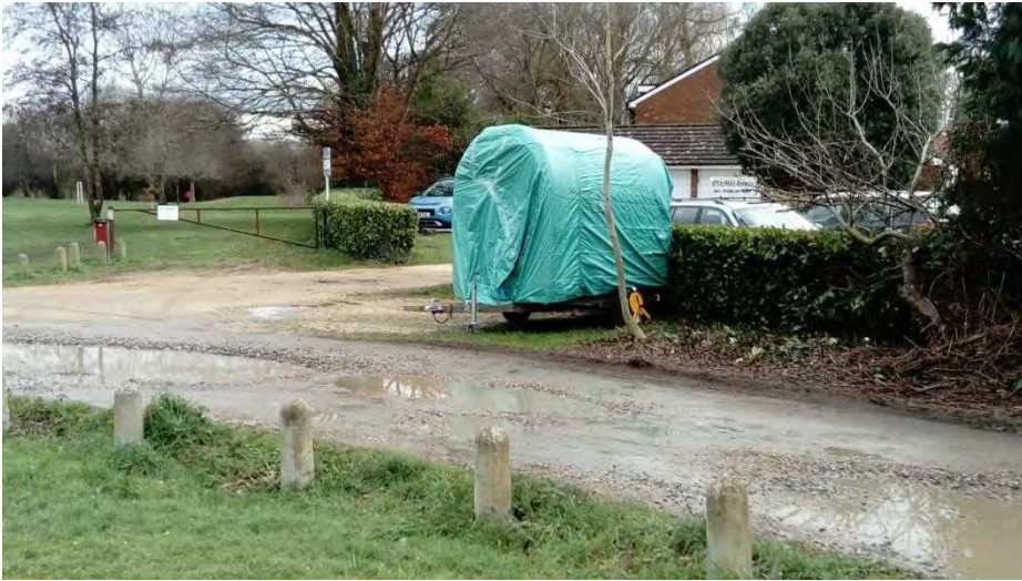
Figure 1 - Trailer