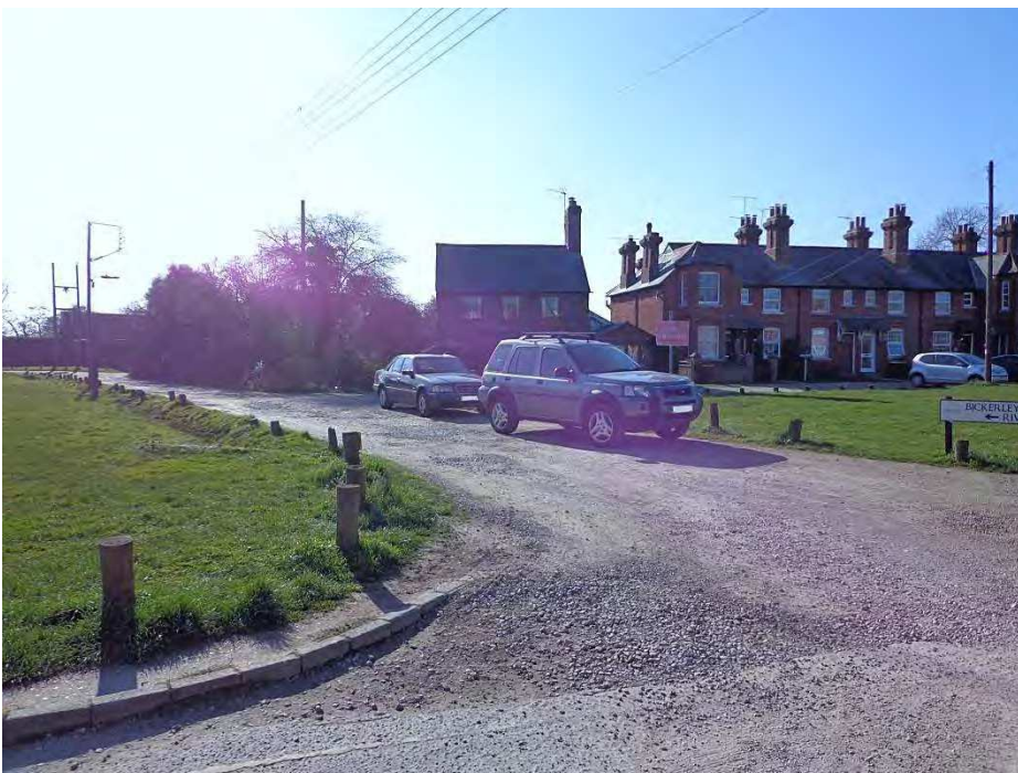
Figure 2 - Two cars parked on track