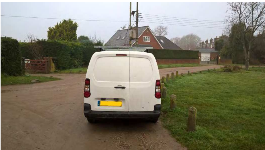
Figure 3 - White van parked on track