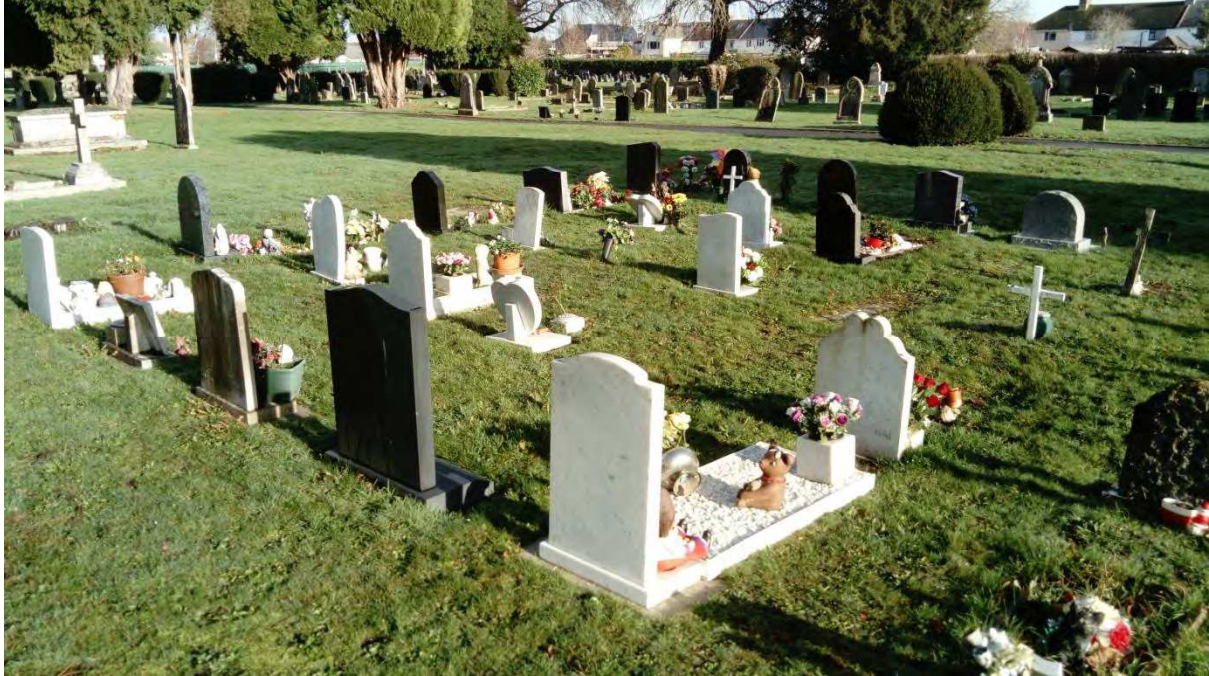
Figure 1 - "Baby Graves" area of Ringwood Cemetery

Chris Wilkins, Town Clerk Direct Dial: 01425 484720 Email: chris.wilkins@ringwood.gov.uk