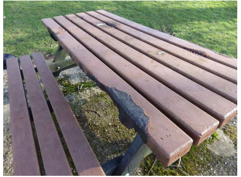
Fig. 1 – Burn damage to picnic table at Carvers Play Area