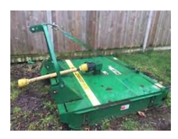
Figure 3 – Major Grass-topper: