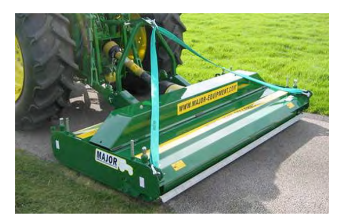
Figure 1 – Major Roller-Mower (Note – This is a Library image)