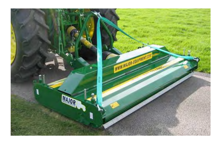
Figure 1 – Major Roller-Mower (Note – This is a Library image)