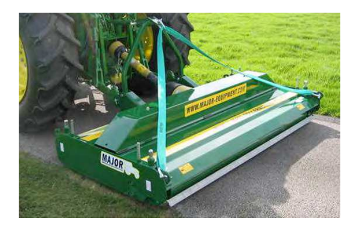
Figure 1 – Major Roller-Mower (Note – This is a Library image)