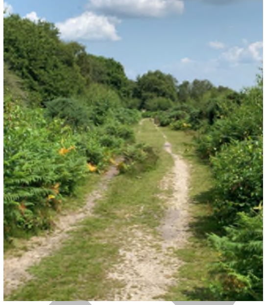
Picket Hill road