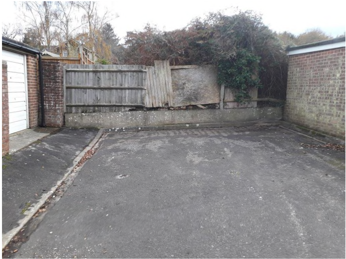
Figure 1 – Fence at rear of Frobisher Close