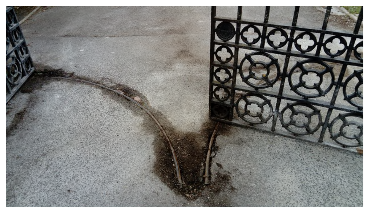
Figure 2 - Gates and wheel tracks