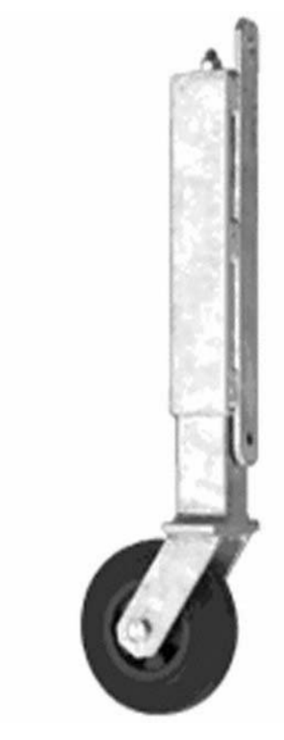
Figure 4 - Gate supporting wheel (proposed)