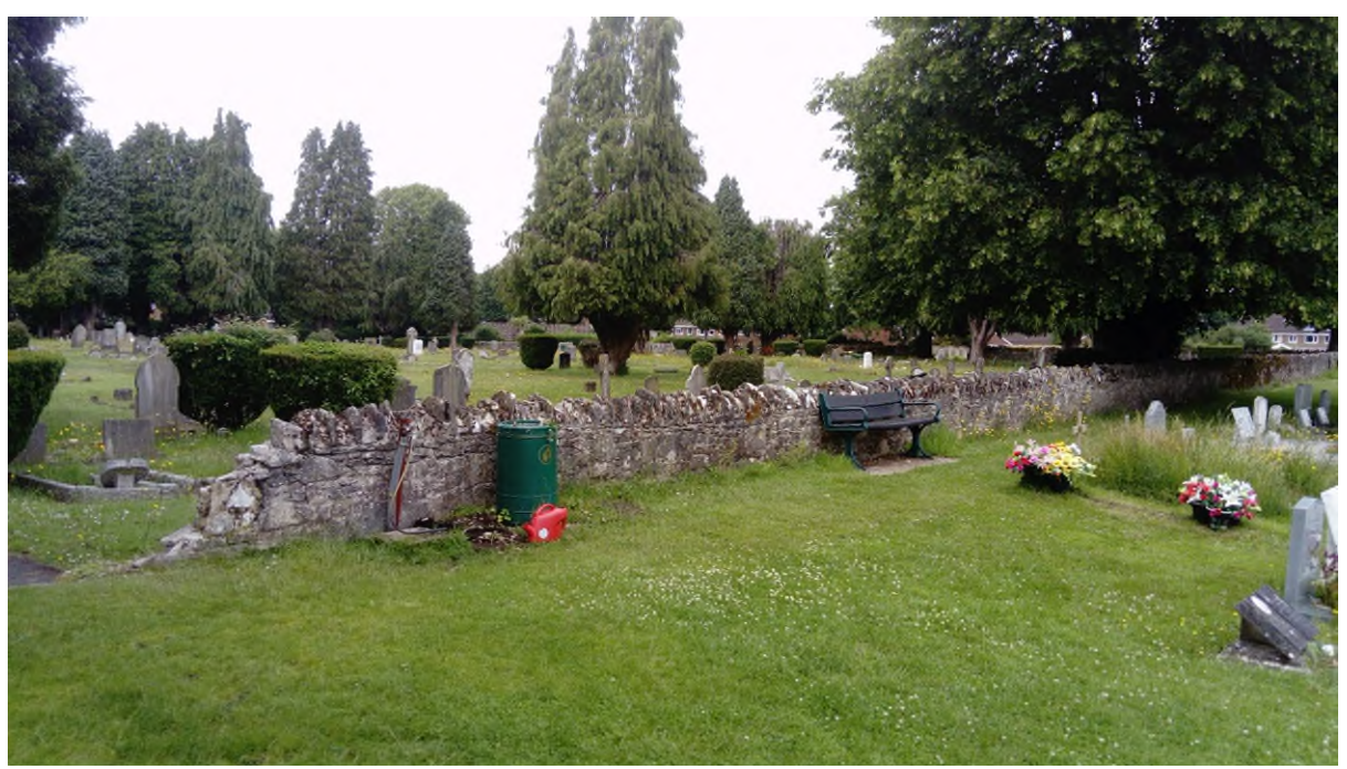
Figure 2 - Alternative location now proposed