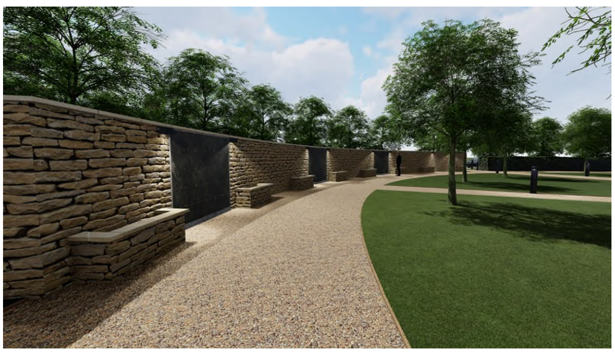
Figure 3 Wall columbarium with local stone