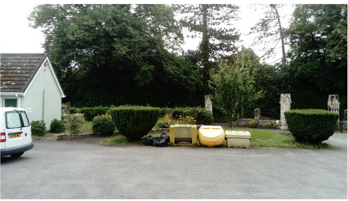
Figure 1 - Location proposed in 2014