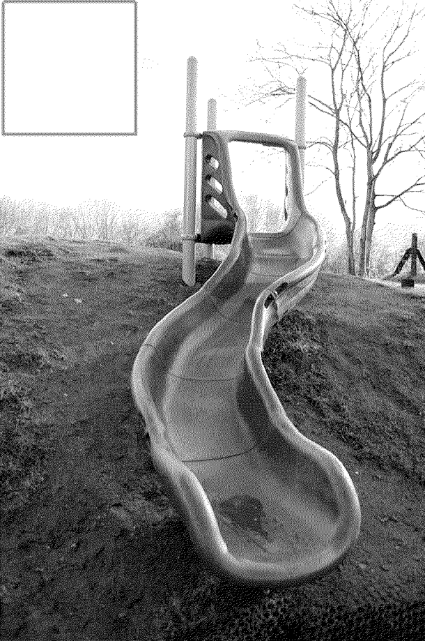
Chameleon Slide twists and turns

Put a tick in the box next to which slide you like most